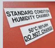
Lean / 5S labeling