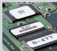
Circuit board labeling