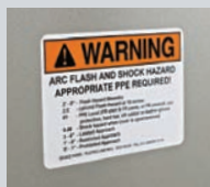
Arc flash labeling