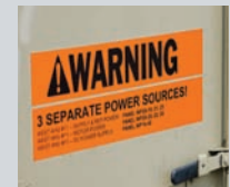
Equipment and panel labeling