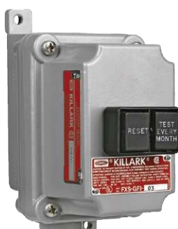
Ground Fault Interrupter Complete Unit (Box and Cover)