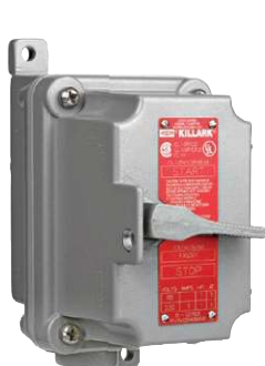
Tumbler Switch Complete Unit (Box and Cover)