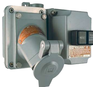
UGRGF Series GFI Control Station with UGR Receptacle

Class I, Div. 1 & 2, Groups C, D Class I, Zones 1 & 2, Groups IIB, IIA Class II, Div. 1 & 2, Groups E, F, G Class III Type 3