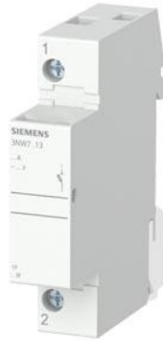
SENTRON, cylindrical fuse holder, 10x38 mm, 1-pole, In: 32 A, Un AC: 690 V