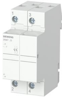
SENTRON, cylindrical fuse holder, 10x38 mm, 2-pole, In: 32 A, Un AC: 690 V