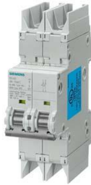
Circuit breaker 10kA, 2-pole, C, 0.3 A according to UL 489-480Y/277V