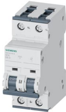
Miniature circuit breaker 400 V 10kA, 2-pole, D, 0.3 A, D=70 mm