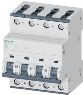
Miniature circuit breaker 400 V 10kA, 4-pole, D, 25A, D=70 mm