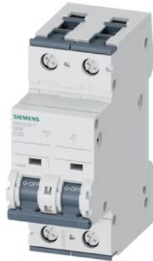
Miniature circuit breaker 400 V 6kA, 2-pole, C, 30 A