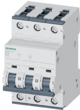
Miniature circuit breaker 400 V 6kA, 3-pole, C, 13 A, D=70 mm