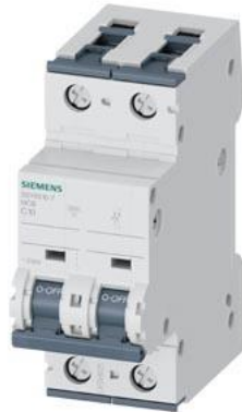
Miniature circuit breaker 230 V 6kA, 1+N-pole C, 10A, D=70 mm