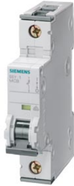
Miniature circuit breaker 230/400 V 15kA, 1-pole, C, 4A, D=70 mm