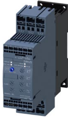
SIRIUS soft starter S0 25 A, 11 kW/400 V, 40 °C 200-480 V AC, 110-230 V AC/DC spring-type terminals