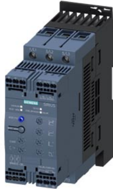
SIRIUS soft starter S2 45 A, 22 kW/400 V, 40 °C 200-480 V AC, 110-230 V AC/DC spring-type terminals