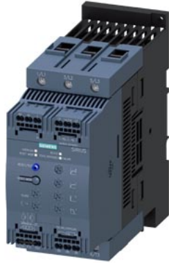
SIRIUS soft starter S3 80 A, 55 kW/500 V, 40 °C 400-600 V AC, 24 V AC/DC spring-type terminals Thermistor motor protection