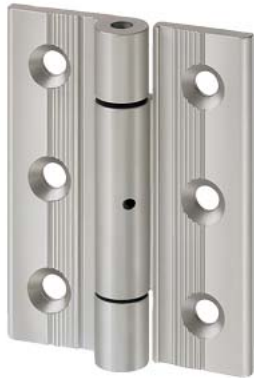
Additional hinge for 40 mm profile for hinge switch 3SE228 Delivery with mounting accessories