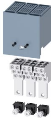
wire connector TA2.5 6 x 14 AWG...2 AWG for 6 cables 3 units accessory for: 3VA51