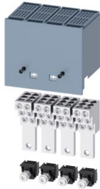
wire connector TA2.5 6 x 14 AWG...2 AWG for 6 cables 4 units accessory for: 3VA51