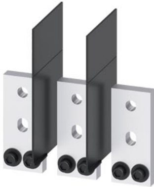
bus connector extended front mounted; 3 units accessory for: 3VA55; 3VA65