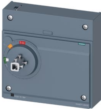
rotary operator with shaft stub for 8UC retrofit accessory for: 3VA55; 3VA65/66