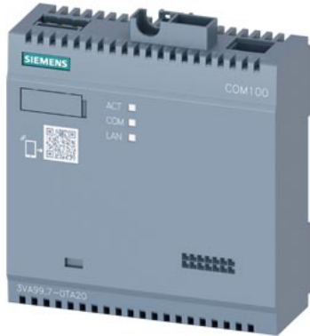
data concentrator COM100 accessory for: 3VA6