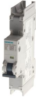
Miniature circuit breaker 240 V 14kA, 1-pole, C, 4A, D=70 mm according to UL 489