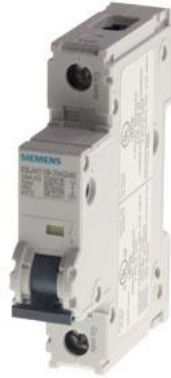
Miniature circuit breaker 240 V 14kA, 1-pole, C, 20 A, D=70 mm according to UL 489, equal polarity