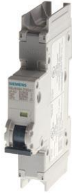
Miniature circuit breaker 240 V 10kA, 1-pole, D, 30 A, D=70 mm according to UL 489