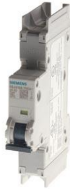
Miniature circuit breaker 240 V 10kA, 1-pole, D, 40A, D=70 mm according to UL 489