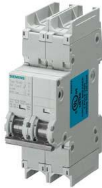
Miniature circuit breaker 240 V 14kA, 2-pole, D, 5 A, D=70 mm according to UL 489