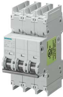
Miniature circuit breaker 240 V 14kA, 3-pole, C, 16A, D=70 mm according to UL 489