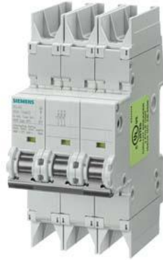
Circuit breaker 10kA, 3-pole, D, 20A according to UL 489-480Y/277V