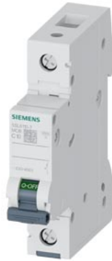
Miniature circuit breaker 230/400 V 6kA, 1-pole, C, 10 A