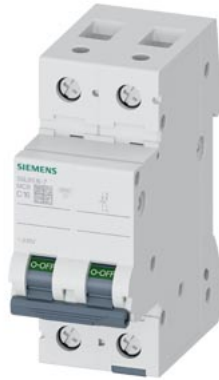
Miniature circuit breaker 230 V 6kA, 1+N-pole, C, 16A