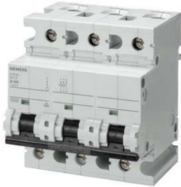
Miniature circuit breaker 400 V 10kA, 3-pole, C, 125 A, D=70 mm