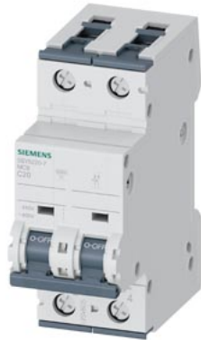
Circuit breaker Universal current 440 V DC 400 V AC 10kA, 2-pole, C, 20A