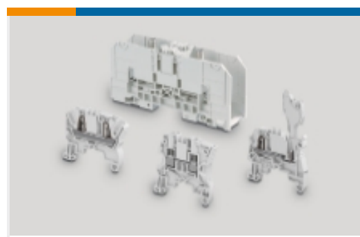
Modular Terminal Blocks(182)