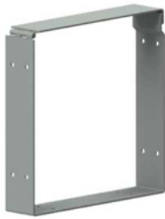
* Representative image